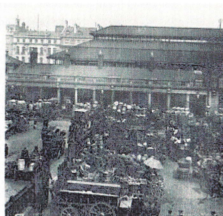
Covent Garden market, c. 1910