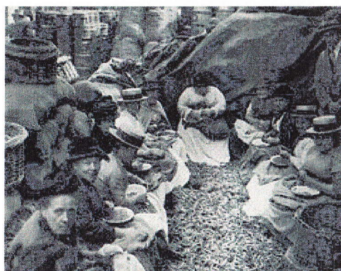
Shelling peas, Covent Garden 1922